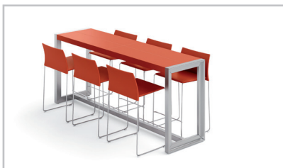
Strato high table